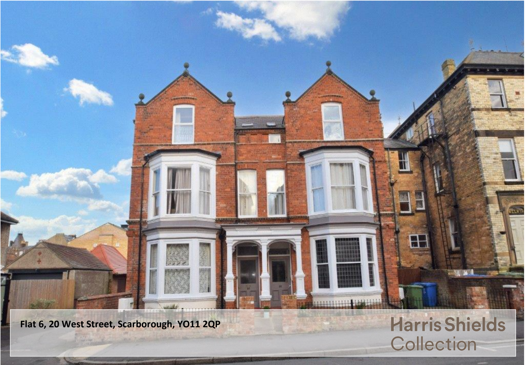
Flat 6, 20 West Street, Scarborough, YO11 2QP